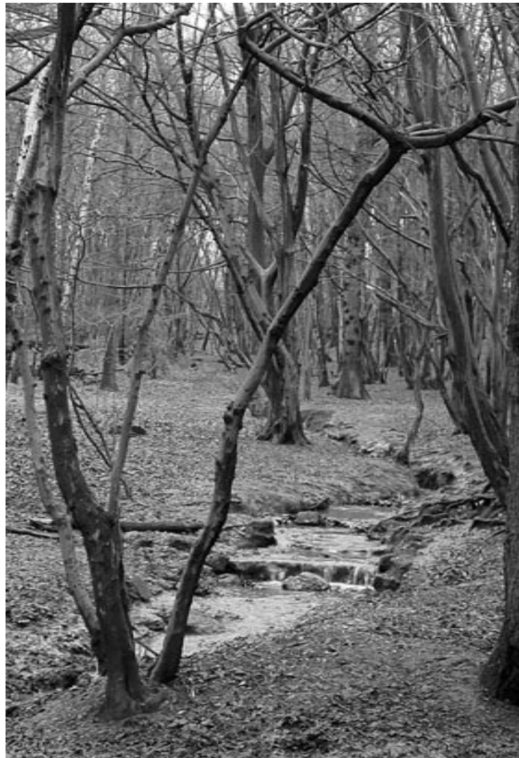
Coldfall brook in spate

The site can be found at www.coldfallwood.info