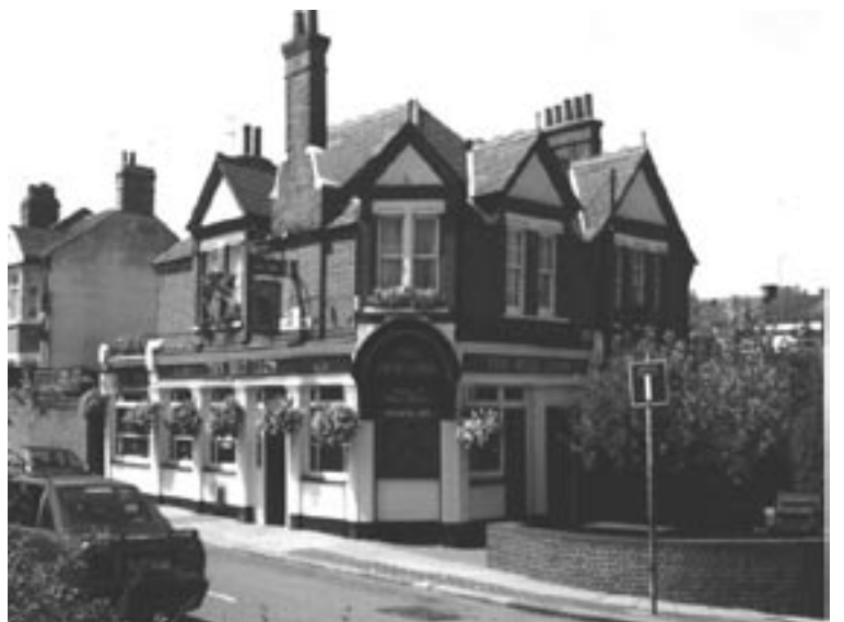
The Red Lion in its heyday.