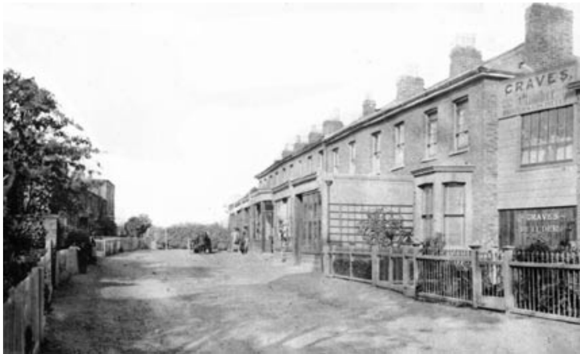
Church Lane as it used to be.